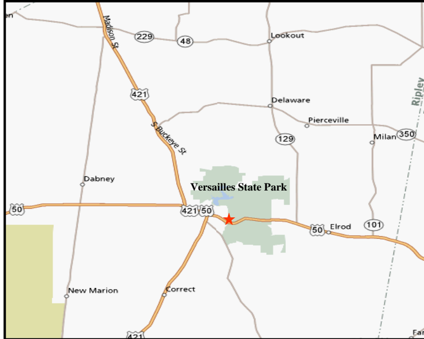
The Versailles State Park is located on US Highway 50 approximately 1 mile east of Versailles (Please see insert for map of the Park)

Detach and keep map and information on opposite side for your records.